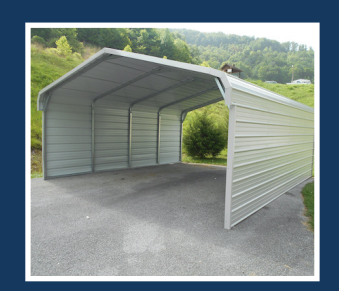
METAL CARPORTS IN FRONT OR SIDE YARD