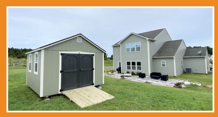
MUST BE IN THE REAR YARD

DESIGN/MATERIAL COMPATIBLE WITH PRIMARY STRUCTURE