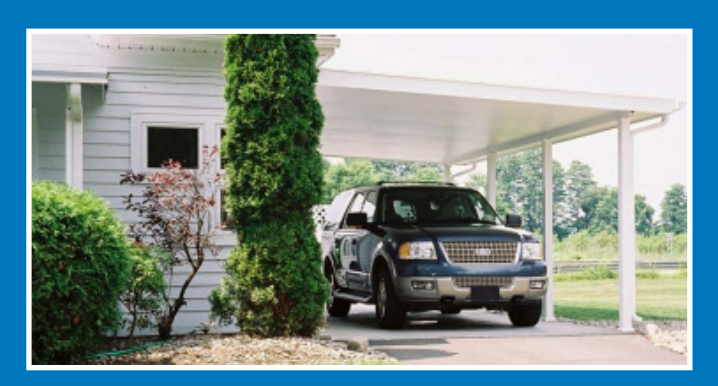
MUST BE ON A PAVED SURFACE. DETACHED CARPORTS CAN BE IN THE REAR YARD BUT MUST HAVE A DRIVEWAY.

DESIGN/MATERIAL COMPATIBLE WITH PRIMARY STRUCTURE