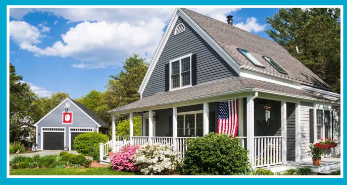
MUST HAVE A PAVED DRIVEWAY AND A DOOR

DESIGN/MATERIAL COMPATIBLE WITH PRIMARY STRUCTURE