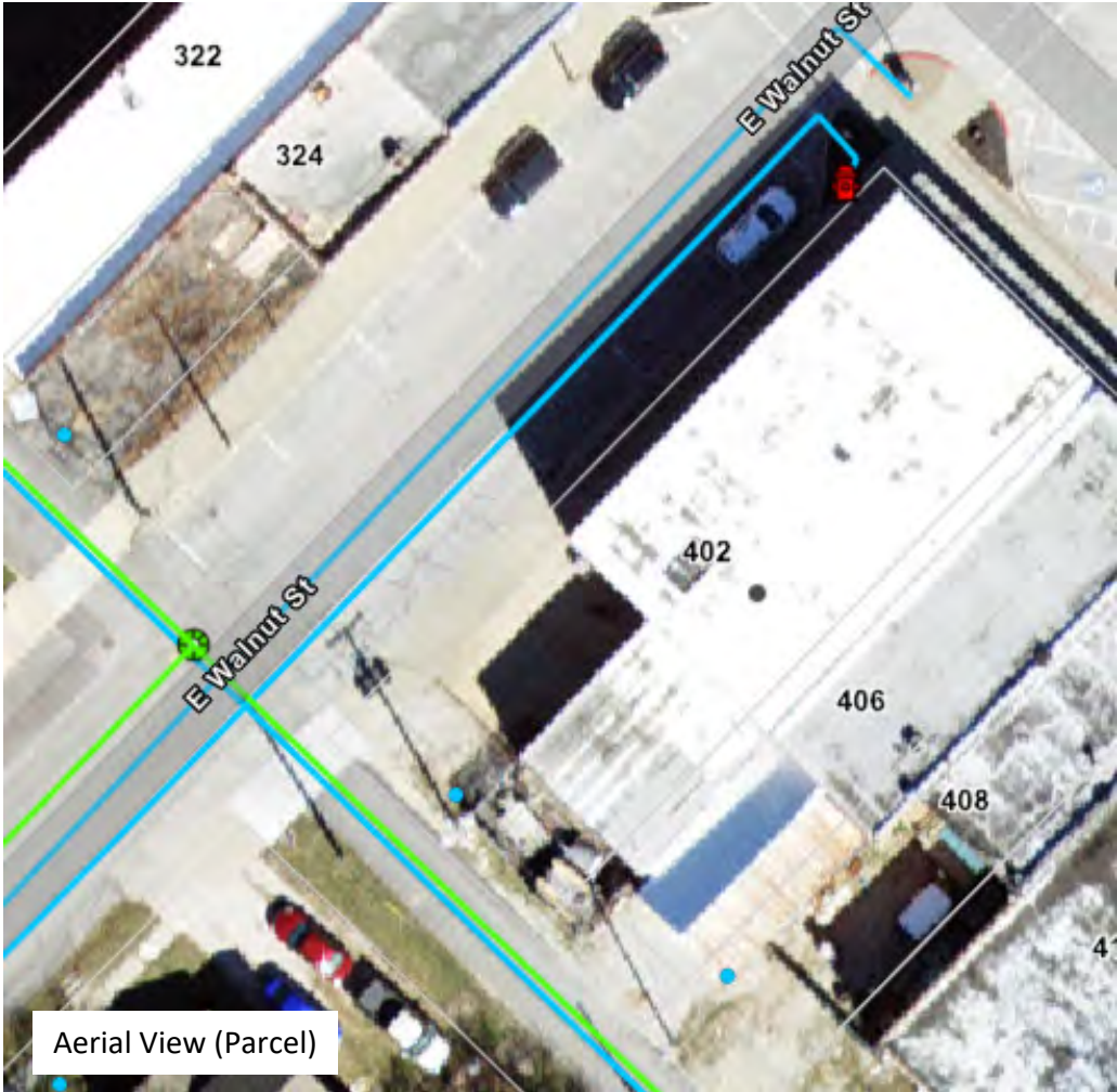
Aerial View (Parcel)