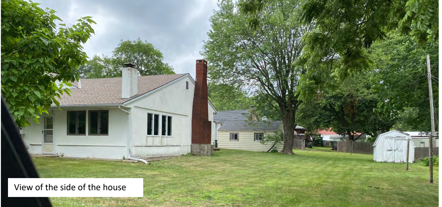
View of the side of the house