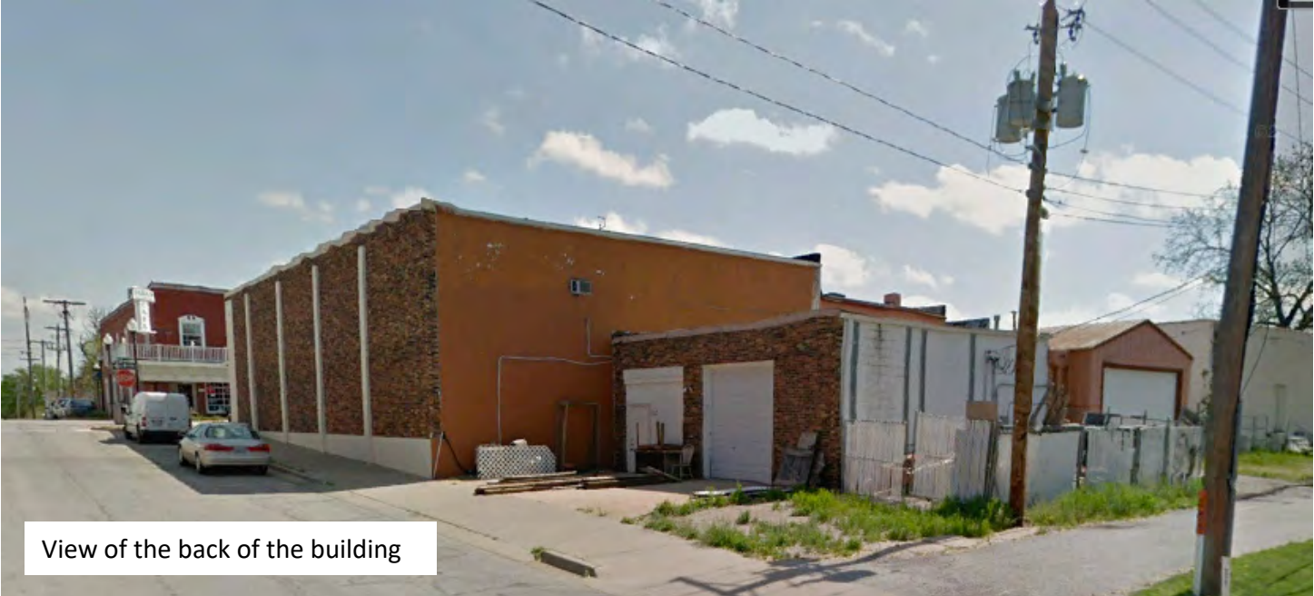
View of the back of the building