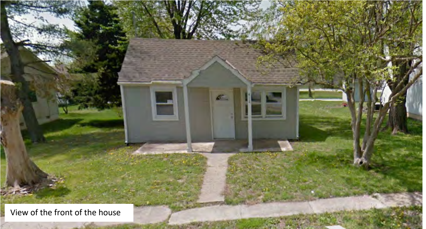
View of the front of the house