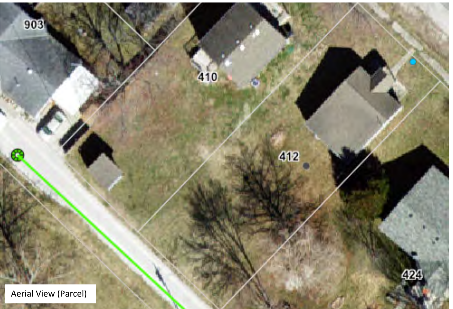
Aerial View (Parcel)