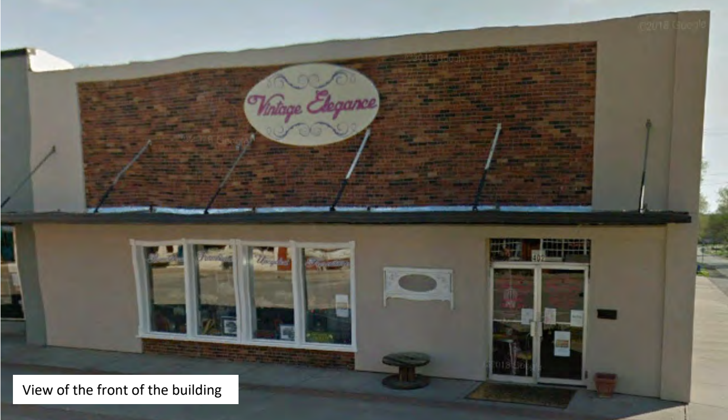
View of the front of the building