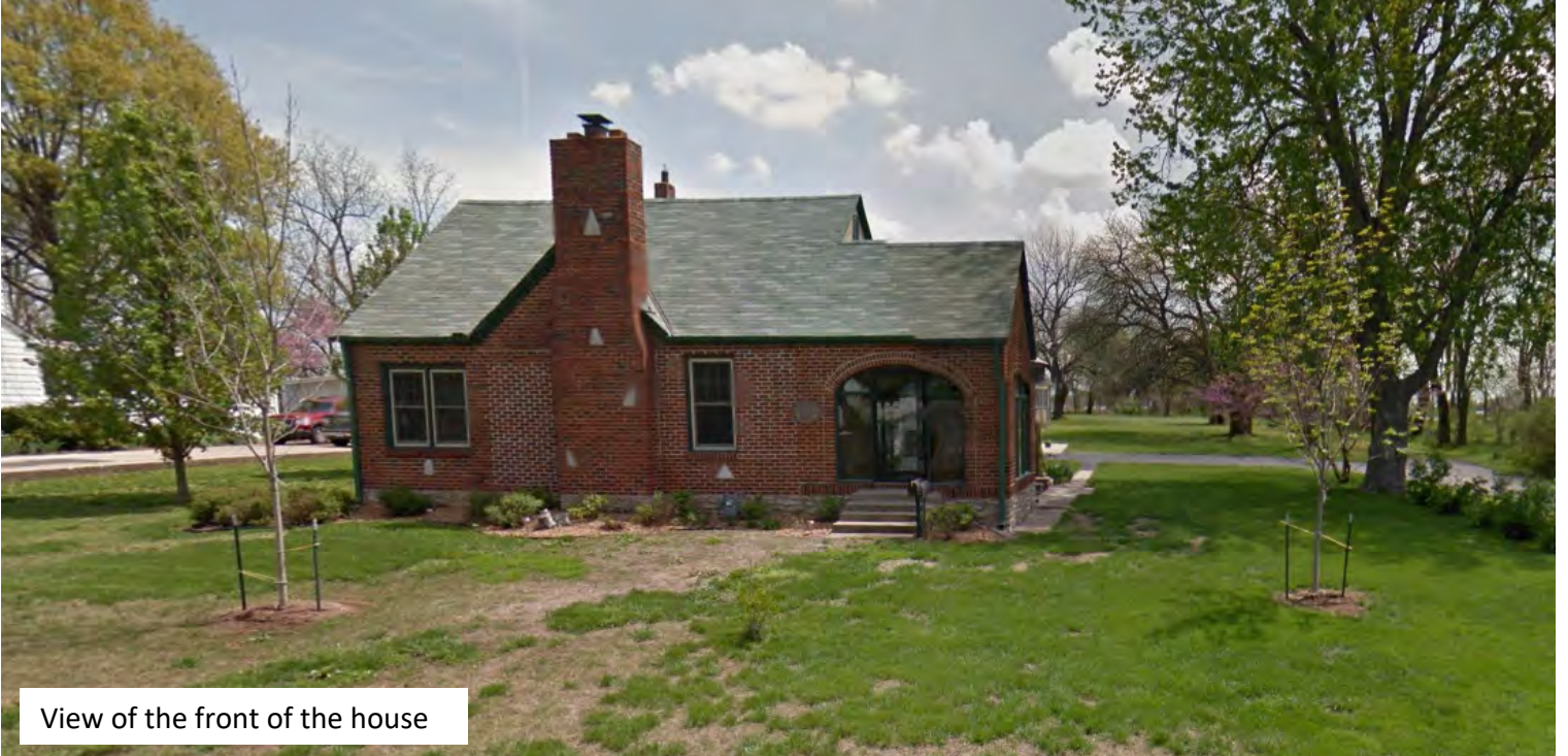
View of the front of the house