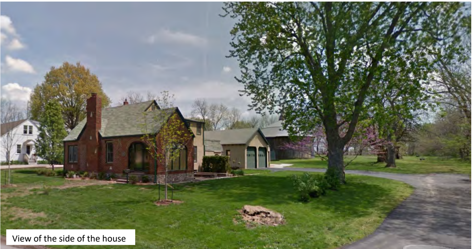
View of the side of the house