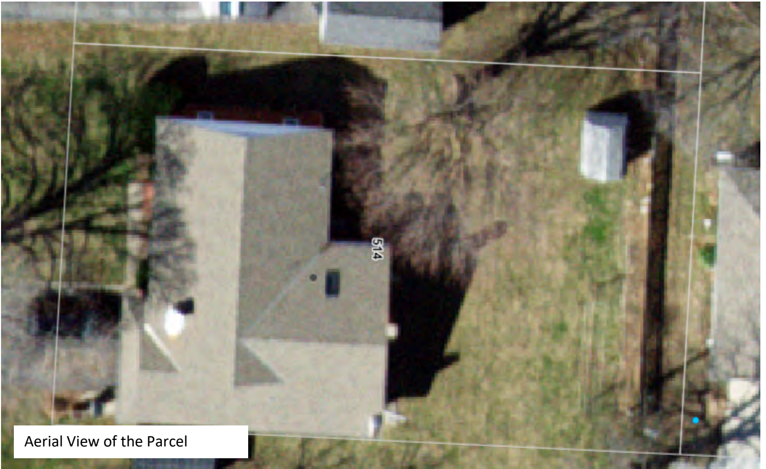
Aerial View of the Parcel