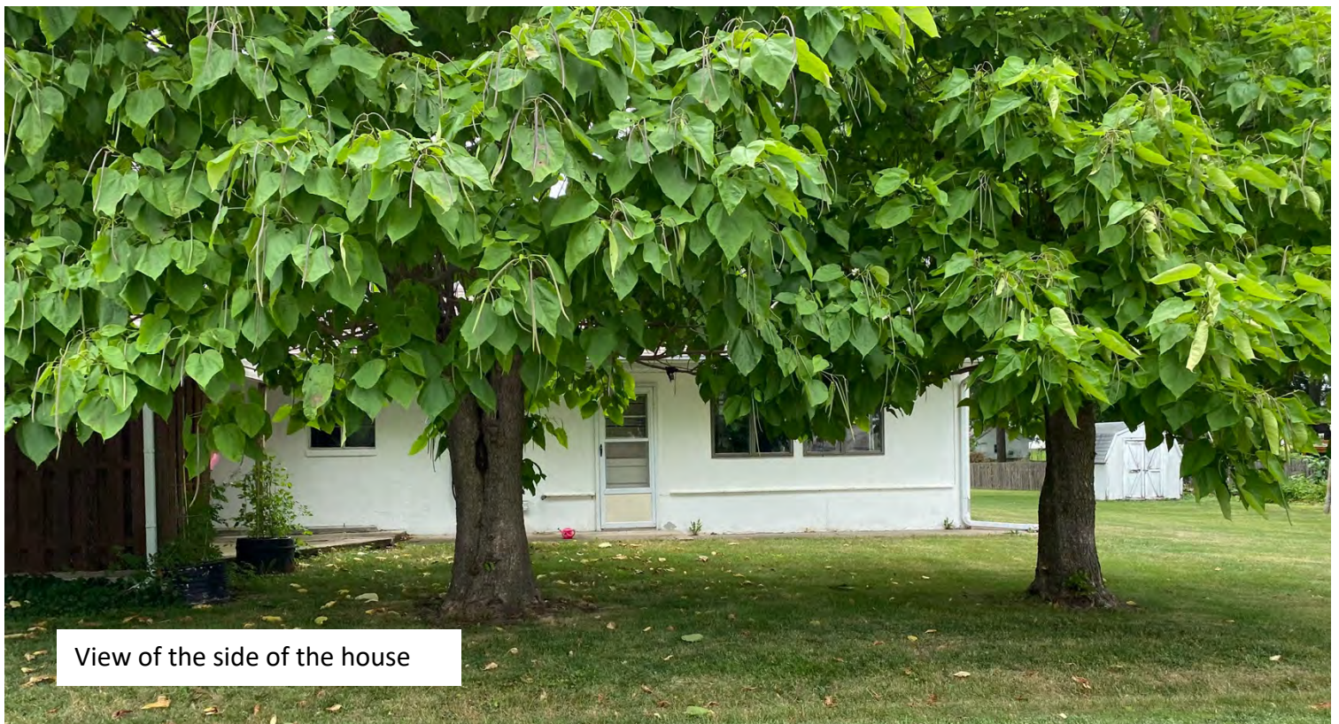
View of the side of the house