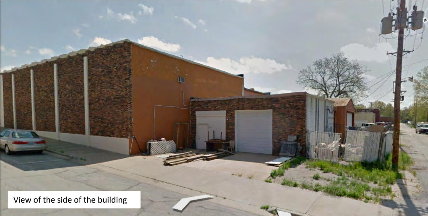
View of the side of the building